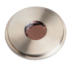
Figure 1 AP3 X-ray Window