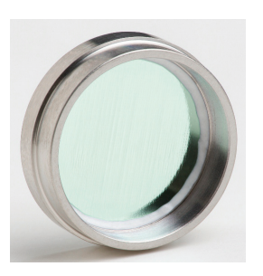
Figure 2 AP5 X-ray Window