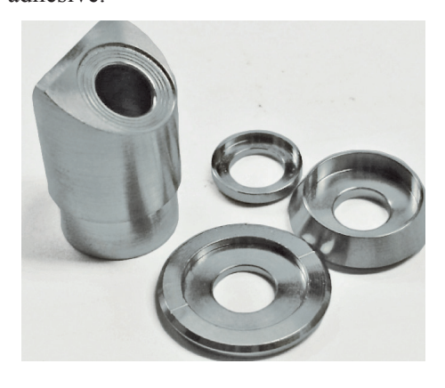
Figure 2 Sample Window Mounts

AP windows are bonded to a metal mount using a vacuum compatible adhesive.