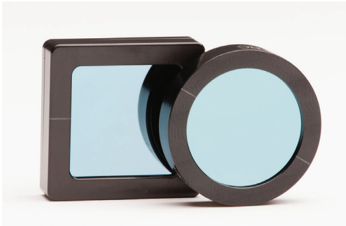
SIR Polarizer (mounting optional)