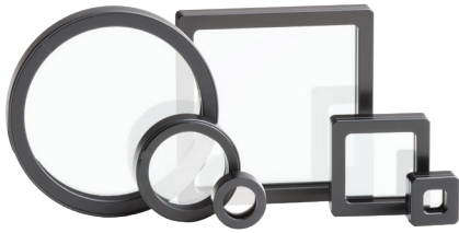
ABS Polarizers (mounting optional)