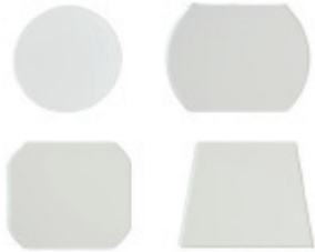
Various Cut Polarizer Shapes and Sizes

Standard Mounts - Moxtek can provide protective mounting for our polarizer plates that reduce the risk of damaging the wire-grid polarizer structure. These mounts come in standard sizes shown in the table below.