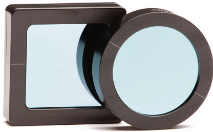
SIR Polarizer (mounting optional)

ProFlux® SIR Series Infrared polarizers provide excellent broadband infrared performance for applications in the 3-12µm wavelengths. These IR polarizers utilize Moxtek's unique Nanowire® Technology, specially engineered anti-reflective coatings, and high quality thin silicon substrates to achieve high transmission and contrast. Moxtek's high volume production capacity ensures availability of parts sized to fit your application.