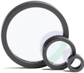
UBB Polarizers (mounting optional)