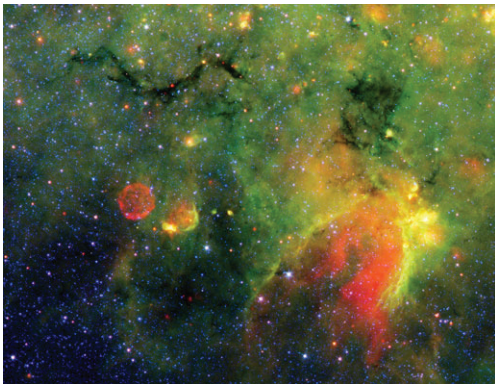
Image of Stellar Snake enabled by IR polarizer technology.