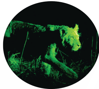
Broadband IR polarization, such as provided by Moxtek BIR04A and BIR05A, is essential in enhancing night vision and deep space imaging applications that generate stunning images.

For warranty and ordering information, please visit www.moxtek.com .