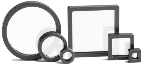
BIR Polarizers (mounting optional)