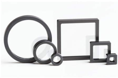
BIR Polarizers (mounting optional)