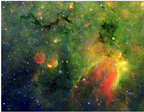
Image of Stellar Snake enabled by IR polarizer technology.

Tp- Transmitted "p" polarization, Ts- Transmitted "s" polarization, Tp/Ts