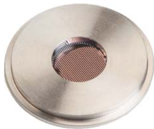
Mounted AP3 X-ray Window