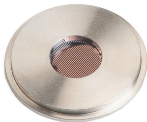
Mounted AP3 X-ray Window