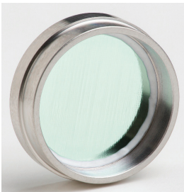
Figure 2 AP5 X-ray Window