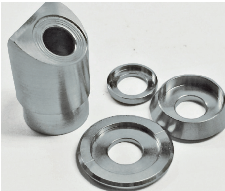
Figure 2 Sample Window Mounts

AP windows are bonded to a metal mount using a vacuum compatible adhesive.