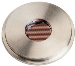
Figure 1 AP3 X-ray Window