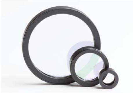
UBB Polarizers (mounting optional)

Ultra Broadband polarizers are designed to offer an excellent solution for almost any multi-wavelength application. The wide-band characteristics of this polarizer, enables a wide range of products and technologies. Performance begins at 300nm and works well throughout the visible and infrared range enabling its use in a wide variety of applications (see sidebar). With anhydrous Fused Silica substrate material, the performance will work well up to the 4µm wavelength.