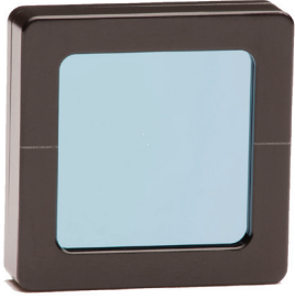
Mounted SIR ProFlux Polarizers