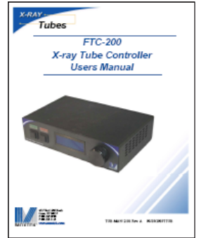
User instruction manual