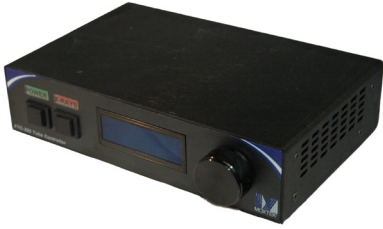
FTC-200 Tube Controller