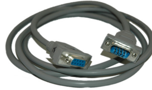
D89 Extension Cable (For connection to the x-ray tube)