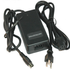
External Power Supply with Interface cable