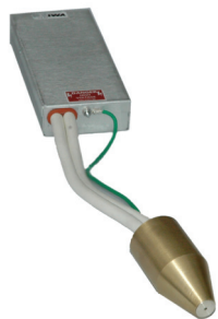
MUHV50 X-ray Tube