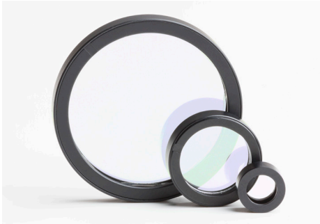
UBB Polarizers (mounting optional)

Ultra Broadband polarizers are designed to offer an excellent solution for almost any multi-wavelength application. The wide-band characteristics of this polarizer, enables a wide range of products and technologies. Performance begins at 300nm and works well throughout the visible and infrared range enabling its use in a wide variety of applications (see sidebar). With anhydrous Fused Silica substrate material, the performance will work well up to the 4µm wavelength.