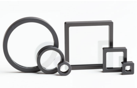
PBS Beamsplitters (mounting optional)

ProFlux® beamsplitter Nanowire® Technology is optimized to operate at 45°, providing durable polarizing beamsplitters. These beamsplitters can be used for a variety of both imaging and non-imaging applications for display products and scientific instruments. The ProFlux polarizing beamsplitter’s wide angular aperture, excellent performance and exceptional reliability offer an excellent design choice.