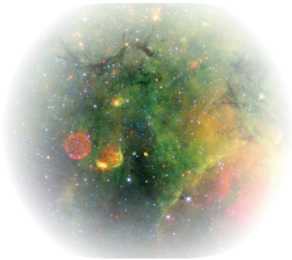
Image of Stellar Snake enabled by IR polarizer technology.

Tp- Transmitted "p" polarization, Ts- Transmitted "s" polarization, Tp/Ts