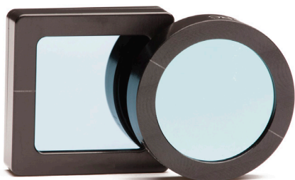
BIR Polarizers (mounting optional)

The ProFlux® BIR Series Infrared polarizer, designed using Moxtek® Nanowire® Technology, provides unparalleled broadband infrared performance. Moxtek's high volume production capacity ensures availability and supports high volume applications.