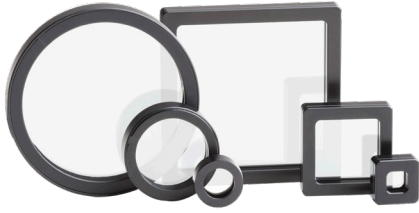
ABS Polarizers (mounting optional)